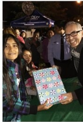
25th Annual Atwater Village Tree Lighting